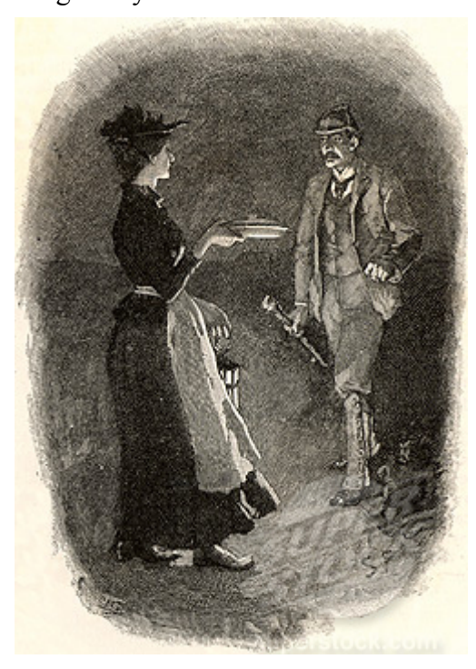
Curried mutton and a suspect: Toward a smoking gun test? (Table 5)

"'Can you tell me where I am?' he asked. 'I had almost made up my mind to sleep on the moor when I saw the light of your lantern.'