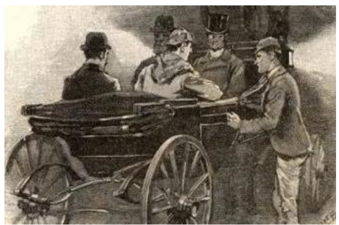
Holmes discusses lame sheep with stable boy – an auxiliary outcome test. (Table 7)

"Have you noticed anything amiss with them of late?"