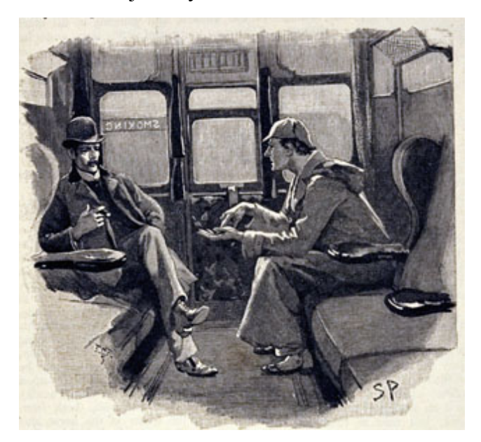
Holmes outlines the case.

I lay back against the cushions, puffing at my cigar, while Holmes, leaning forward, with his long, thin forefinger checking off the points upon the palm of his left hand, gave me a sketch of the events which had led to our journey.